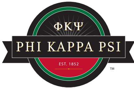
PHI KAPPA PSI - PRIMARY LOGO