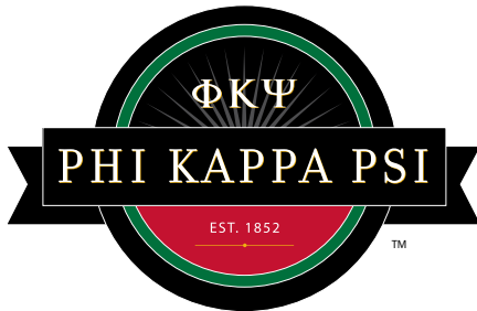
PHI KAPPA PSI - PRIMARY LOGO