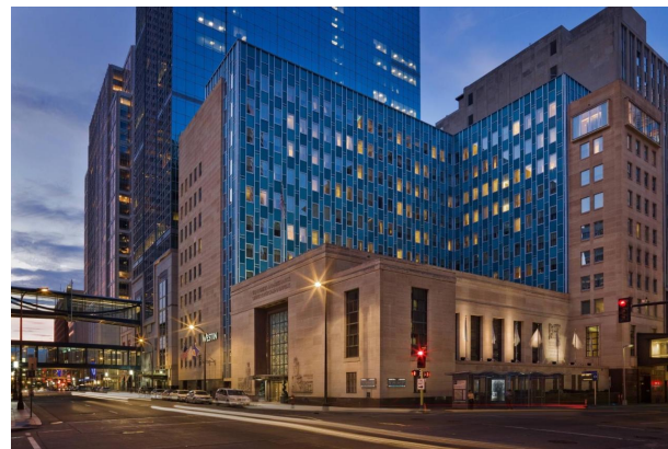
WESTIN MINNEAPOLIS 88 South 6th St, Minneapolis, MN 55402