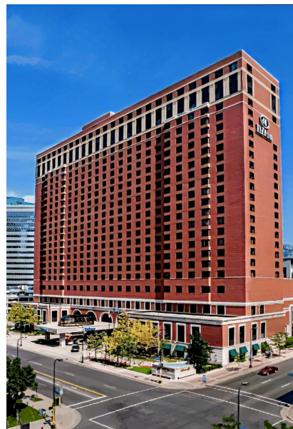
HILTON MINNEAPOLIS 1001 S Marquette Ave, Minneapolis, MN 55403